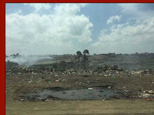
The Rubbish tip where children play and forage.