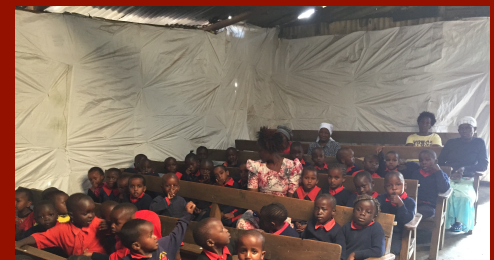
The Nairobi Preschool